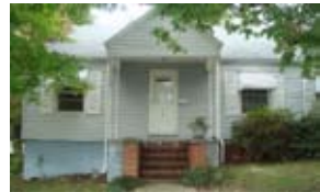
H-2439. 834 W. Haymore St., Mount Airy, Surry $60,000.

INVESTMENT OPPORTUNITY! 3 brm, 1 bath home on 1.5 acres in a convenient location! Hardwood floors, detached garage w/lots of potential. Repairs and TLC needed! Bring offer!