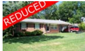
H-1614. 117 Howard St, Pilot Mountain, Surry $69,900.

BRING OFFERS! Lots of room for the money! Brick rancher, possible 4th BR in bsmt, large lot. 1 1/2 bath on main level and full in bsmt. Walking distance to town.