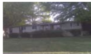
H-2405. 409 Newsome Road, King, Stokes $39,900.

Three bedroom singlewide on .30 acres. Three bedroom, 1.1 baths includes stove and refrigerator, city water. Frontage on two roads.