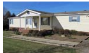
H-3166. 416 Bray Ford Road, Dobson, Surry $79,000.

Neat and clean home with over 1700 sq. ft., front porch, back deck. New laminate hall & MBR. Workshop. New storage bld. Den w/fpl. 3BR/2BA Home Warranty. Abv grd pool