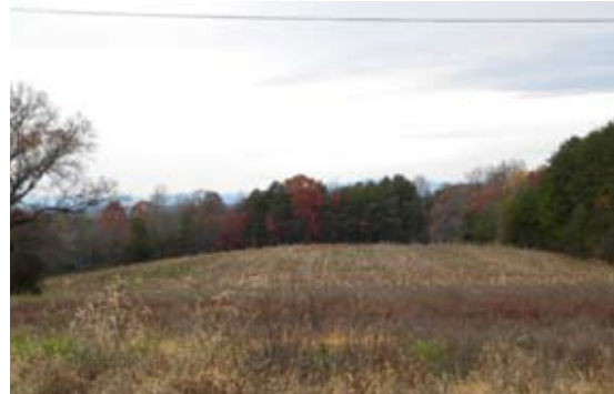
755 Stony Knoll Road, Dobson. Gently sloping land could be farm, organic farm, use for cattle, horses, llamas or alpacas, grow truffles, or vineyard/winery. 1923 Farmhouse with high ceilings, monitor heat, window A/C, 2 bedrooms, 1 bath, front porch with views of Blue Ridge Mountains, and back porch. Being sold as is. 2 story log home without roof could be restored or rebuilt. Barn with stalls. Beauty shop comes with purchase. Located on both sides of county road. Offered at $624,600.

Debbie Swaim, GREEN Broker/Realtor Cell 336-710-5901 Office 336-368-9472 Debbie@carolinafarms.com