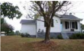
H-2434. 5129 Westfield Rd., Mount Airy, Surry $84,900.

Cute farmhouse on 3 acres. Two bedrooms, eat-in kitchen with pantry off back porch, ceiling fans. Maintenance free vinyl siding. Updates include vinyl windows.