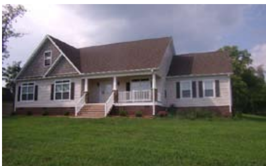
8786 NC Hwy. 89 West, Westfield. Set amid the rolling hills in the heart of Stokes County with pastures, ponds, streams, barns, workshop and plenty of wild life. Rolling land plus stocked four acre pond, fenced pastures, the two story workshop is 28 x 44. Home was built in 2009 and is over 2,500 square feet with an expandable 1,800 sq ft upstairs. Three spacious bedrooms and two full baths, great room with fireplace and kitchen with breakfast nook plus formal dining room—all great spaces. Offered at $695,000.

Andrew Gibbons ALC, GREEN Cell: 336-469-0022 Office: 336-368-9472 Andrewg@carolinafarms.com