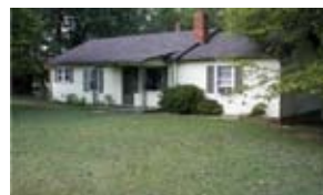
H-1641. 1028 Tom Gordon Rd., King, Stokes $76,900.

Great buy! Home has lots of possibilities! Oak floor in living room, wood burning fireplace, wood stove, large master bedroom, detached workshop. 3BR, 2 baths.