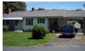
H-3183. 511 Penn Street, Mount Airy, Surry $79,000.

Cute 4 bedroom 2 bath home in downtown Mount Airy near hospital. Living room with fireplace. Washer, dryer, refrigerator and stove all stay. 4th bedroom could be den.