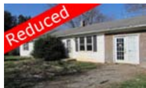
H-3175. 286 Preston Lane, Mount Airy, Surry $38,900.