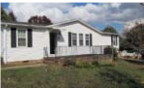
H-3199. 211 Ryan St., Dobson, Surry $89,500.

Great Dobson location! Walk to everything. Home is painted neutral colors. Refrigerator and stove stay. 3BR/2BA. Front porch, back deck. Storage building and carport.